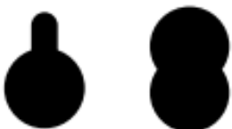
Conventional, Restricted, High Security, SFIC