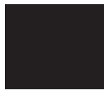
622 (US19) Flat Black