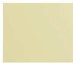
606 (US4) Satin Brass