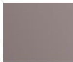
613E Dark Oxidized Satin Bronze (Equivalent)