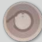
STICKY TAG Model: ACS-MCST