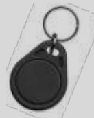
KEY FOB Model: ACS-MK