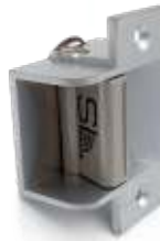
3V MORTISE STRIKE